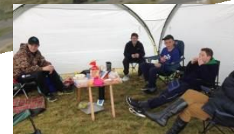
Squad 31 (Aparima College) waiting for their next shoot